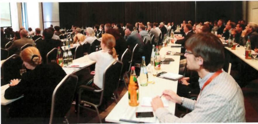
There were more than 300 attendees at the new event

improving ink-jet industry by implementing intelligent sensors, and industrial inkjet for packaging.