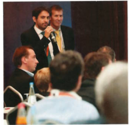
Participants enjoyed a busy programme