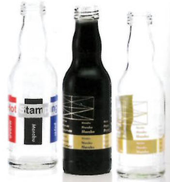
Hot stamping in conjunction with Ultraglass UVGL primers from Marabu.

Ink specialist, Marabu GmbH & Co KG showcased a range of screen printing, pad printing and digital printing inks for the glass industry. This included glossy metallic effects created by hot stamping in conjunction with Ultraglass UVGL primers. This combination is an attractive alternative to inorganic ceramic inks, offering equally brilliant results for a significantly lower price. Marabu also presented its highly adhesive solvent-based Maraglass MGL and Tampaglass TPGL screen printing and pad printing inks, as well as Marashield UV-CGL shades for printing large glass surfaces.