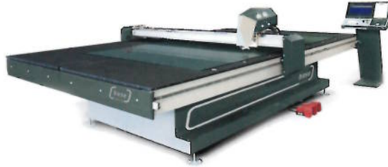
LiSEC launched its 'base' range at glasstec.

and service and maintenance work can be completed easily in most cases. Separately, the company's washing machines now feature automatic infinitely variable brush adjustment, which allows them to maintain consistent contact pressure on the glass sheets at all times. Other innovations on show included re-engineered VFL series vertical sealing machines and the fully automatic TPA system for applying thermo-plastic spacers directly on the glass sheet.